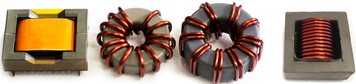
Inductors (from left to right): Shaped Foil, Iron Nickel Toroid, High Iron Toroid, Helical Winding

WCM does not wind helical coils, so for this technology we had to choose from available standard products. We were limited in this choice so as a result the core chosen was slightly oversized from the perspective of energy storage capacity and current handling. Nevertheless, WCM decided to look at the cost and losses of this slightly oversized inductor. While we knew the cost would be on the high side, we were very curious what the loss curve would look like. We chose two helical windings for this core. The first had 22 turns with a copper cross section of 22600 circular mils and the second had 12 turns with a cross section of 38200 circular mils.